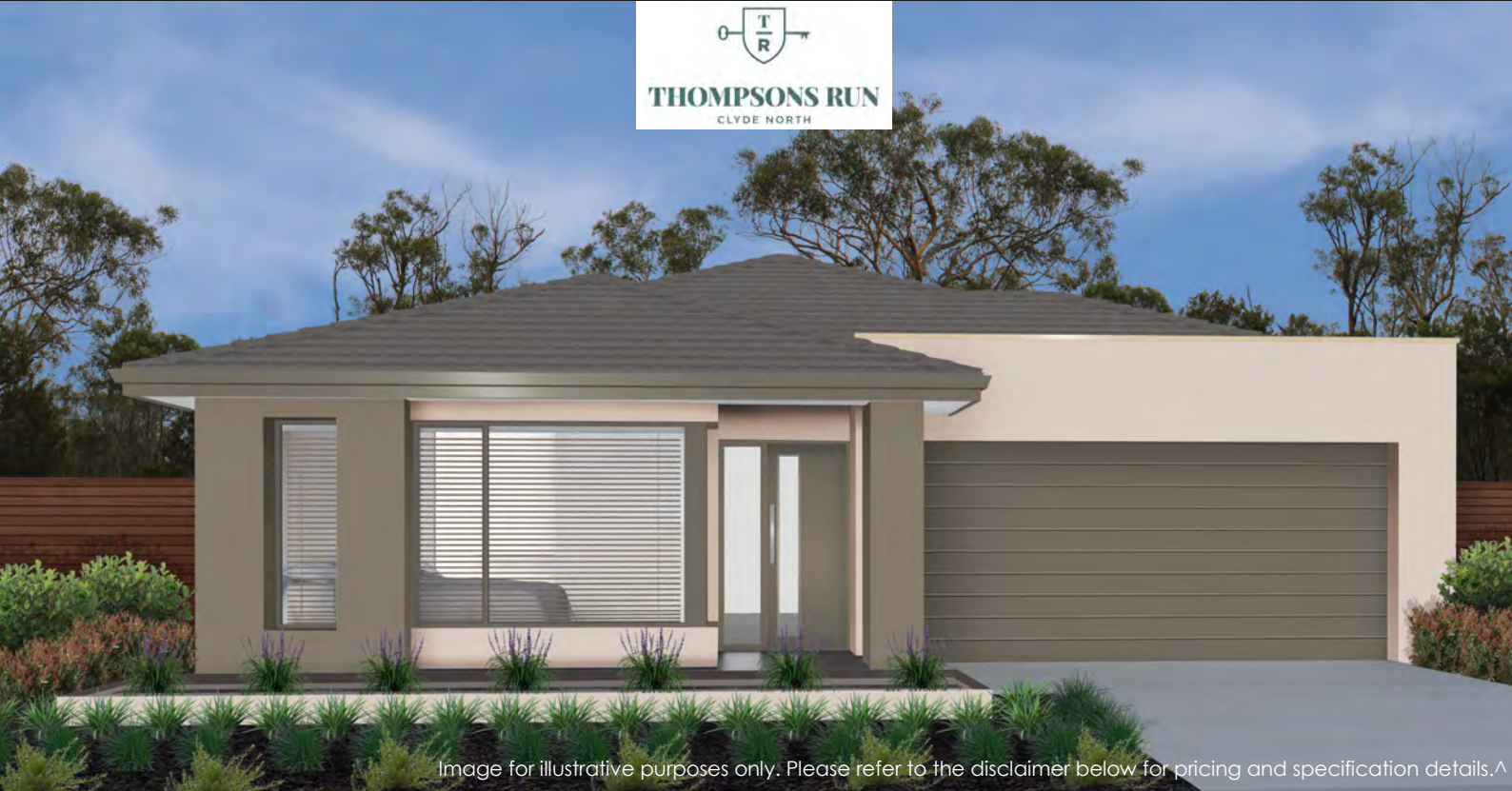
Image for illustrative purposes only. Please refer to the disclaimer below for pricing and specification details. ^