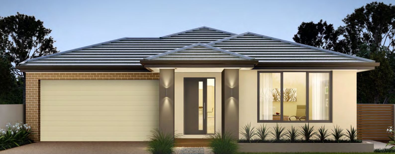
Image for illustrative purposes only. Please refer to the disclaimer below for pricing and specification details. ^